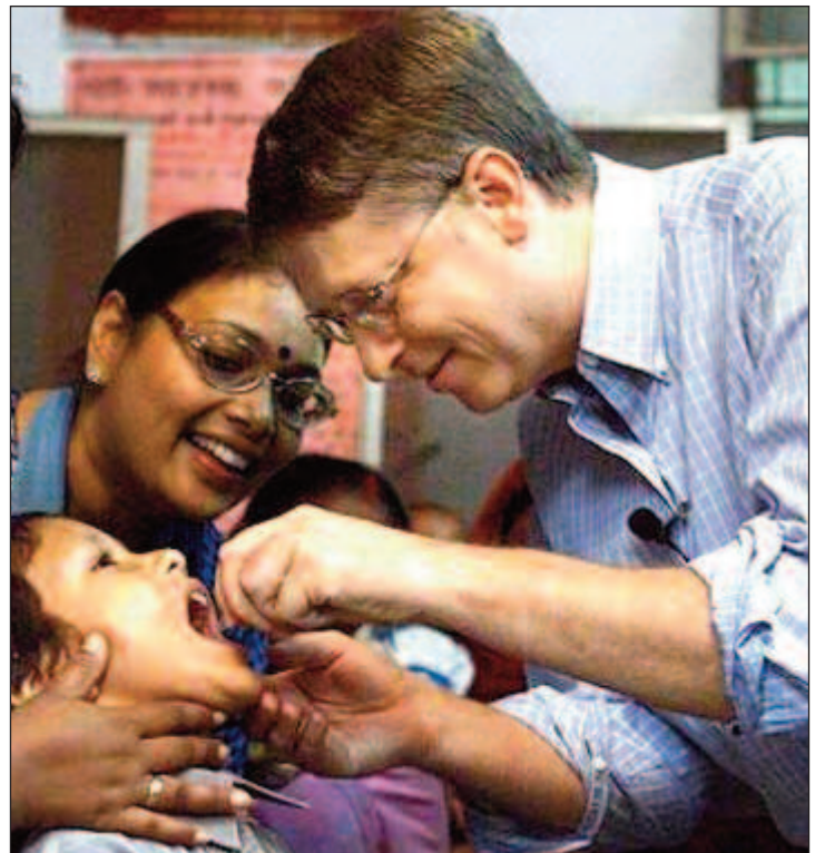
Microsoft chairman Bill Gates takes part in a National Immunisation Day in India in 2008.

encourage the students to contribute at least £1 each to support the final push towards the eradication of polio in Nigeria, Afghanistan, India and Pakistan.